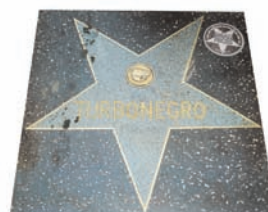
Turbonegro Rare unreleased VOL2 1989-97 (Sealed) $20 AUD (Mint/Mint)