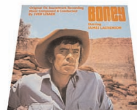
Sven Libaek Boney Australian Soundtrack $60 AUD (M-/VG+)