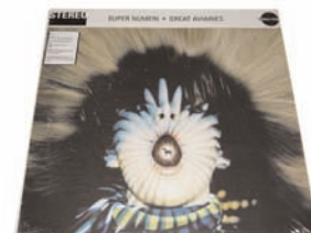
Super Numeri Great Aviaries Sealed Ninja Tune Release $20 AUD (Mint/Mint)