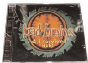
Bad Brains i+i survived (DUB) Great DUB Punk Release Sealed $10 AUD (Mint/Mint)