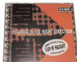
Heading in the Right Direction Australian Soul/Jazz Compilation 1973-77 Sealed CD $15 AUD (Mint/Mint)