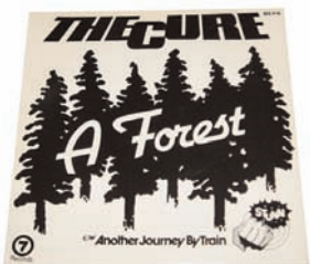
The Cure A Forest Australian Only Stunn Release $150 AUD (Ex/M-)