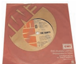
The Saints Lipstick on your collar A label promo EMI release $40 AUD (Ex/Ex)