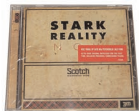
Stark Reality Now Psych Jazz-Funk Ultra Rare Original Repressed - Sealed CD $15 AUD (Mint/Mint)