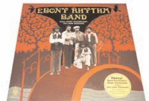
Ebony Rhythm Band Soul Heart Transplant - The Lamp Sessions Rare Psychedelic Funk 2LP Sealed $20 AUD (Mint/Mint)