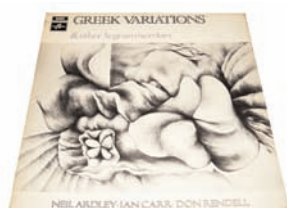
Neil Ardley, Ian Carr & Don Rendell Greek Variations British Free Jazz $650 AUD (Ex/Ex+)