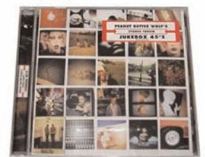
Peanut Butter Wolf's Juke Box 45s U.S Stones Throw Hip Hop Sealed $15 AUD (Mint/Mint)