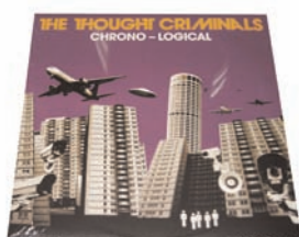
The Thought Criminal Chrono-logical 1st Wave Australian Punk Compilation (2LP sealed) $40 AUD (Mint/Mint)