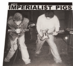
The Imperialist Pigs Cork Screw Pork Sword EP (U.S Hardcore, Pre Pioison Idea Re-Issue) $10 AUD (Mint/Mint)