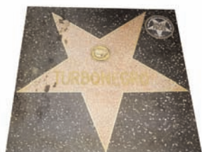
Turbonegro Rare unreleased VOL1 1989-97 (Sealed) $20 AUD (Mint/Mint)