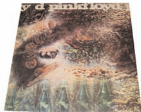
Pink Floyd A Soursful of Secrets Original South African Stereo Release $200 AUD (VG+/EX)